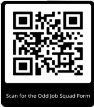
Scan for the Odd Job Squad Form